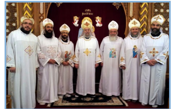
Clergy Meeting at St. Mary Church, on Dec. 19, 2013