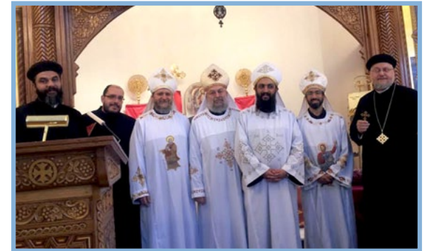
Clergy Meeting in Milwaukee on Oct. 2013